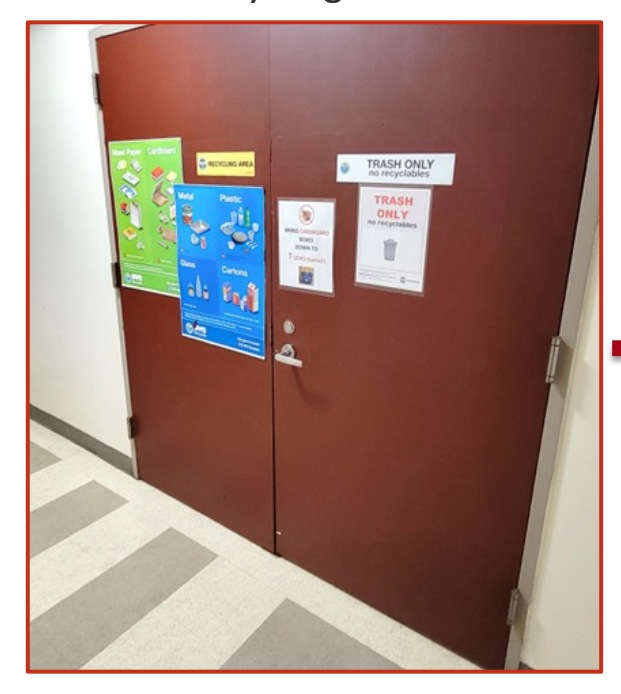
Trash & Recycling cabinets