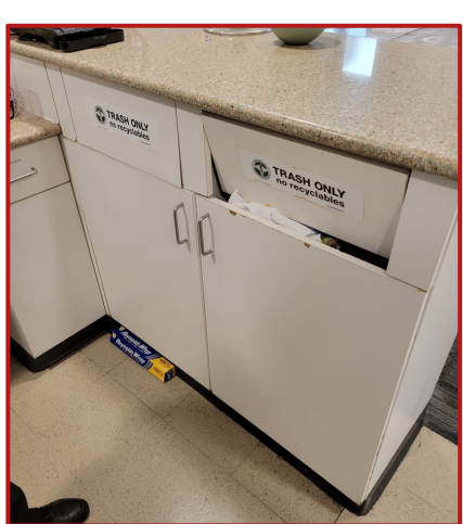
Trash & Recycling in pantries